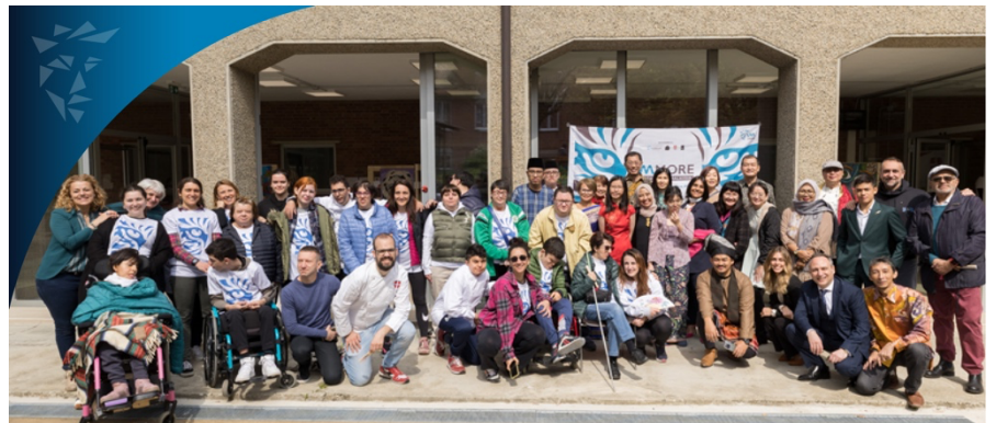
MALAYSIAN ARTISTS WITH AUTISM EXHIBIT IN TURIN FOR WORLD AUTISM AWARENESS DAY